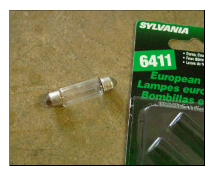
Here's an exciting shot of that festoon bombillla you'll need for your license plate / rear center light.

That pretty well wraps it up. The best allies you have in getting your electrical system up and running properly are John Jensen's wiring diagram and color coding chart. You can always go out on the Internet and check out the Restoration section of the Isetta Tech site listed below where John's two charts are posted. The Isetta Owners of Great Britain Bulletin Board (<a href="https://www.isetta-owners-gb.com">www.isetta-owners-gb.com</a>) is an excellent forum for all topics Isetta. If you're having a problem or just need clarification on something, post your situation out there. You can expect feedback from someone who's been there and done that before.