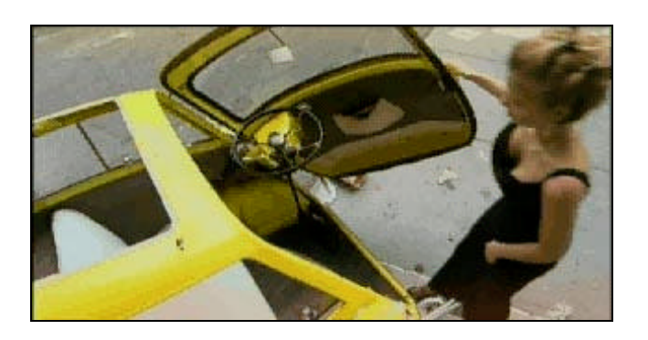
Freeze frame from the Matchbox 20 music video "Unwell".