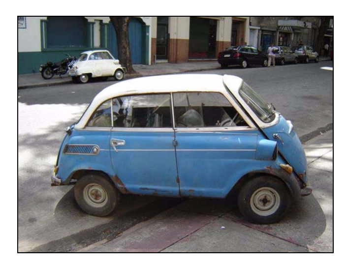
A BMW 600 he recently scored. We need to get in touch with Senor Correa Luna and get the latest body count on his growing car collection.