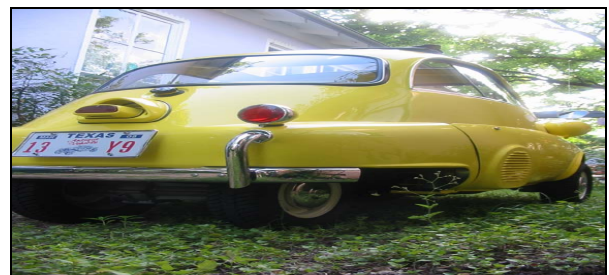
OK, it's goofy lookin' but it fits on the page.