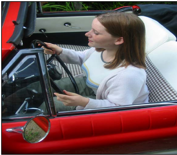
Uh oh. Guess who wants a Metro now?