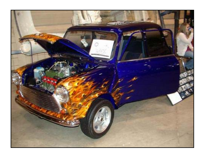
Here's more from the Starbird show ... this time a seriously flamed Mini.