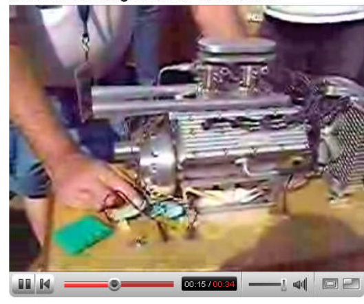
Minature Working Flathead V8 in action

Here's another great scale model engine. This time, it's a good ole Ford flathead. And it runs pretty well too. Check out the video at: