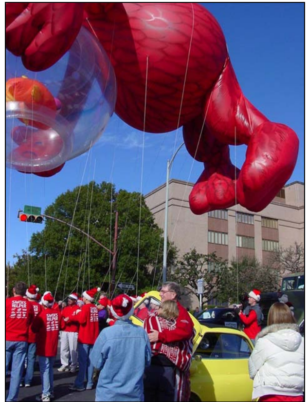
Photographic evidence of the first-ever Trans Town Lake Isetta Balloon Launch in recorded Austin history. Taken just prior to lift off.

The following was spotted on the Isetta Owner's Club Of Great Britain bulletin board a month or so ago. The text shown here appears as it was originally posted. Piece of cake.