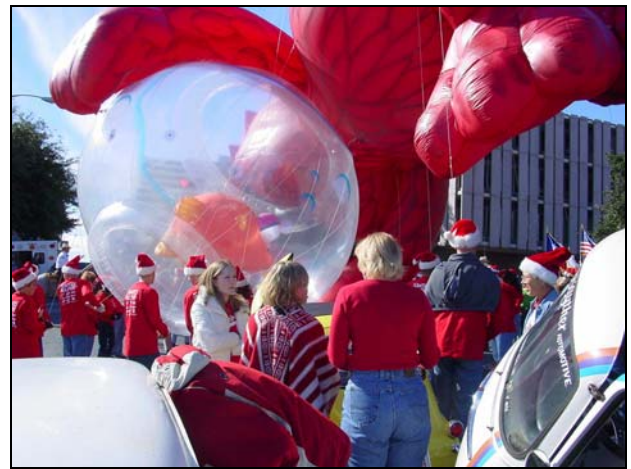
This is what 4 WP looks like from one angle.